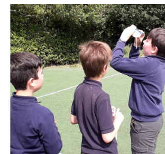
Left: Using a clinometer to measure trees on the school site.

Even during a period of self-isolation, the children remained engaged in their learning, bringing in all the work that they had completed; it made a fascinating display. Year 5 are undoubtedly enthusiastic and hard workers!