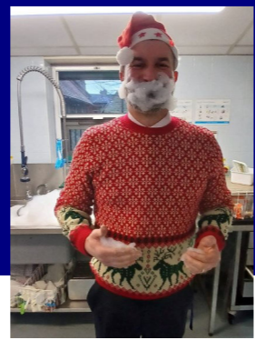
Ho Ho Ho!