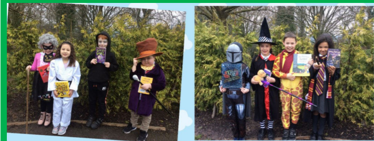
World Book Day 2022!