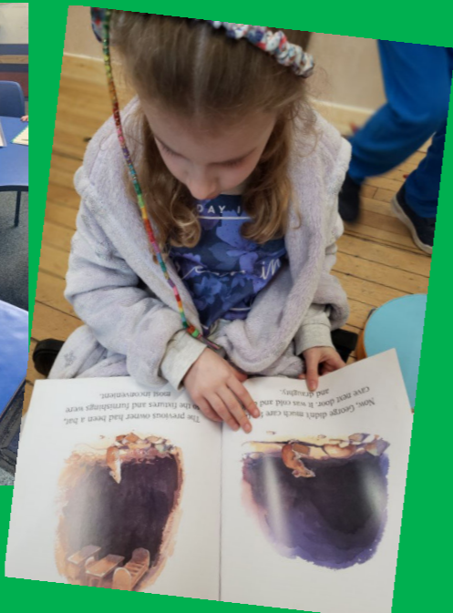
We love reading!