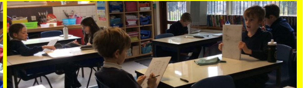
Class 5 have also taken part in practical activities linked to World Maths Day. Here they are learning about co-ordinates whilst playing Battleships!