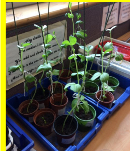
Our broad bean plants are looking really healthy – the recent sun and warmth has helped!

We also planted broad bean seeds and were able to observe them germinating and growing into plants.